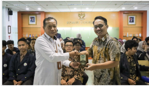
The Judicial Commission (KY) hosted members of the Lembaga Kajian dan Debat Mahasiswa (LKDM) from the Faculty of Sharia and Law, UIN Sunan Gunung Djati Bandung (UIN SGD), on Tuesday (7/4/2026) at the KY Press Room, Jakarta.

08 Apr 2026 20:05:00 WIB | Category: Institutional | Tag: Audien Kinerja KY Judicial Commission Mitra Kerja Socialization | Read: 279 times