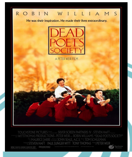
Figure 1. 1 The Official Poster for The Dead Poets Society (1989) Film

○ Hak Cipta milik Politeknik Negeri Jakarta